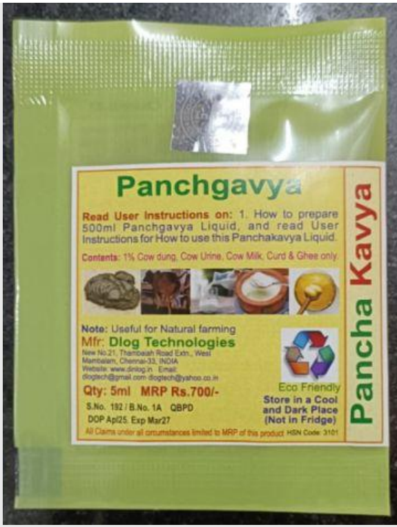
Panchgavya 5ml Pouch model April 25 MRP Rs.700